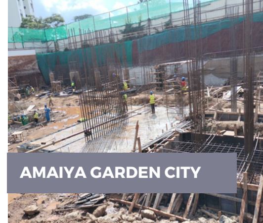
AMAIYA GARDEN CITY