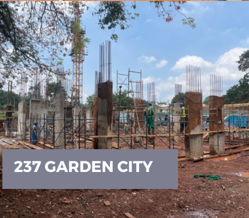
237 GARDEN CITY