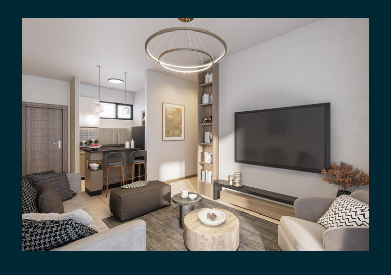
237 GARDEN CITY

1&2 BEDROOM DUPLEXES & 3 BEDROOM APARTMENTS FROM KES 9.2M