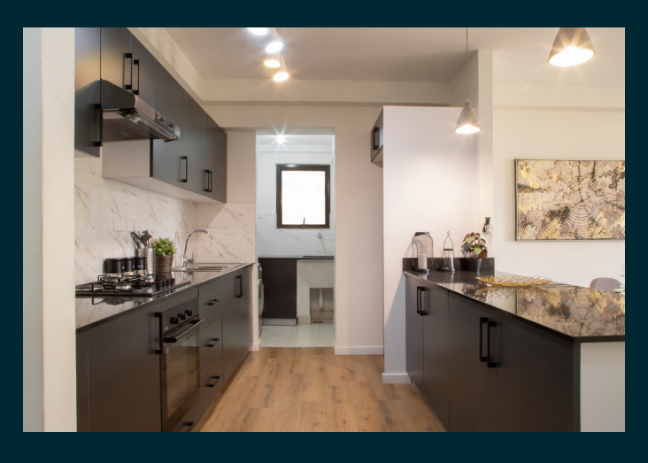
MI VIDA GARDEN CITY

1, 2 & 3 BEDROOM APARTMENTS FROM KES 8.8M