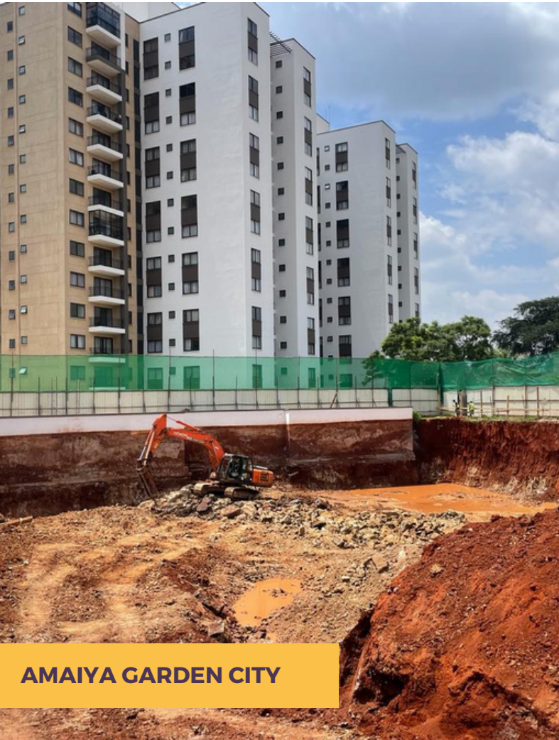
AMAIYA GARDEN CITY

KEZA Riruta - Planned January Works Excavation complete. Blinding works are ongoing.