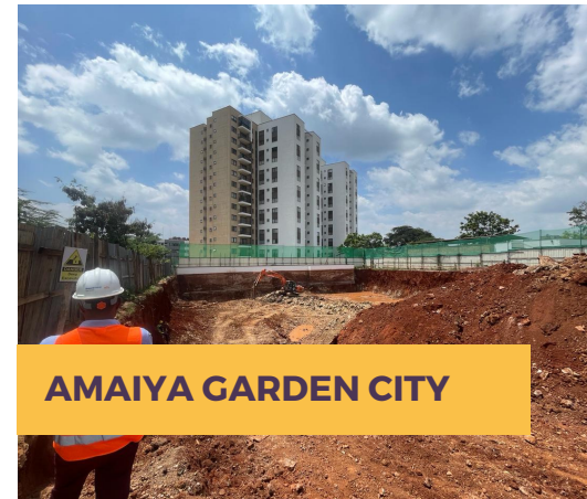
AMAIYA GARDEN CITY