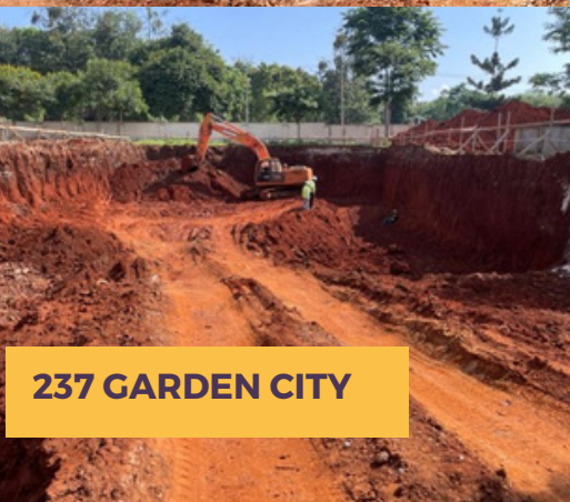
237 GARDEN CITY

Visit any of our sites or follow the progress of your investment via our blog. www.mividahomes.com/blog