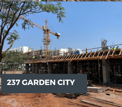
237 GARDEN CITY

To track construction progress visit our website blog at www.mividahomes.com/blog