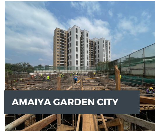
AMAIYA GARDEN CITY