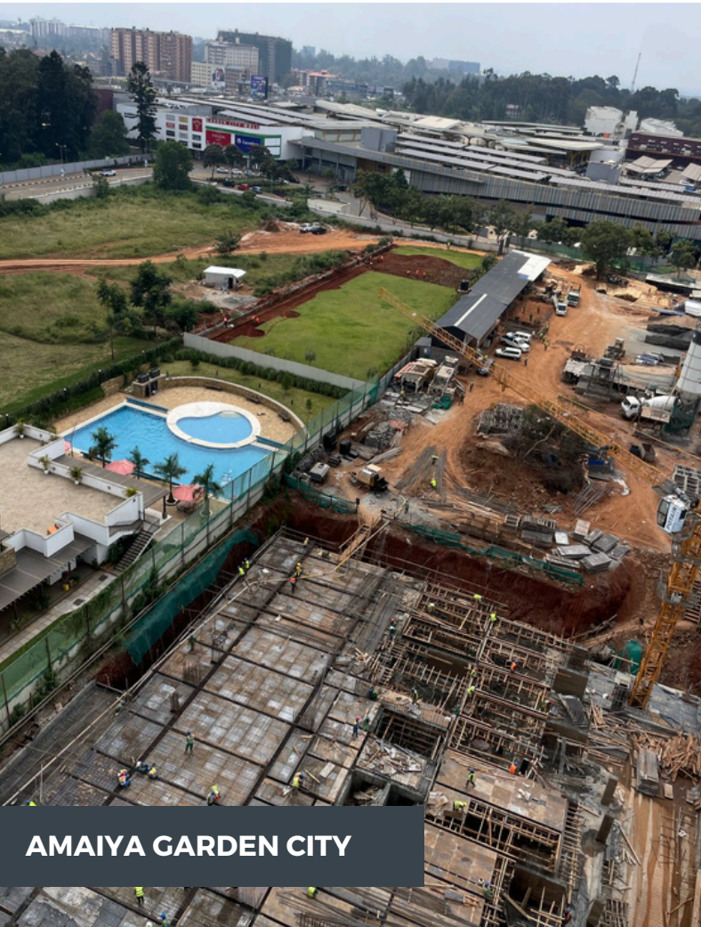
AMAIYA GARDEN CITY

We are excited to provide an update on the progress of our three ongoing residential projects. Our dedicated teams have made significant advancements, particularly between the 5th and 8th floors, focusing on slabs, walls, and columns.