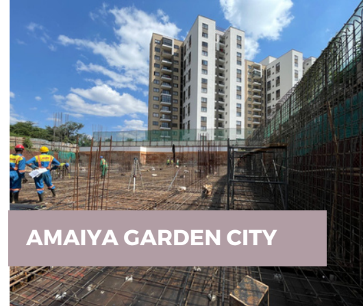
AMAIYA GARDEN CITY