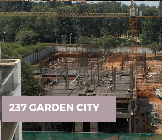
237 GARDEN CITY

To track construction progress visit our website blog at www.mividahomes.com/blog