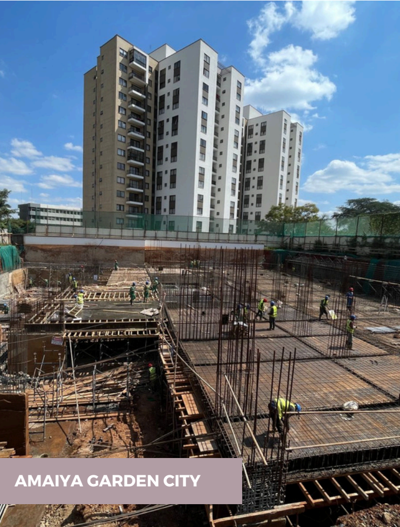
AMAIYA GARDEN CITY

Our teams have been diligently working on slab, concreting, and reinforcement tasks this month, ensuring that each stage meets our high standards of quality and safety.