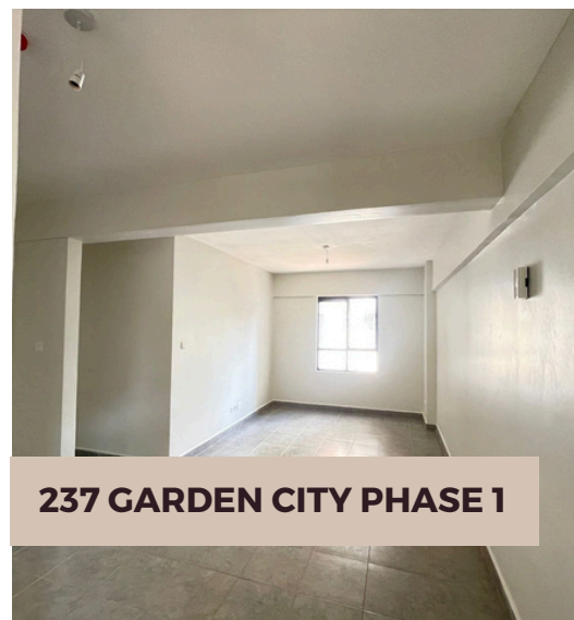
237 GARDEN CITY PHASE 1