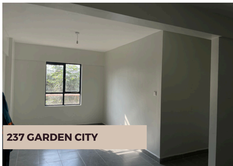
237 GARDEN CITY