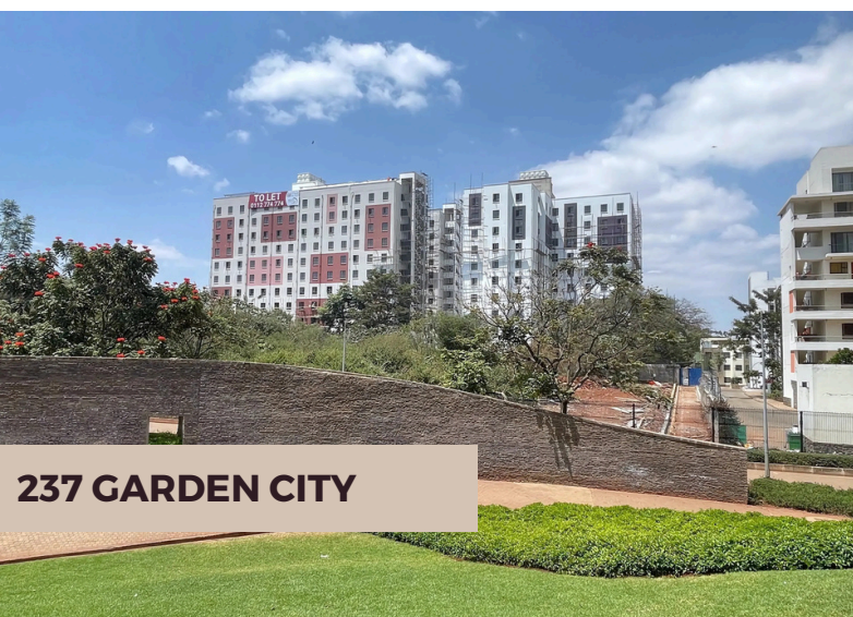
237 GARDEN CITY

We remain committed to delivering every project on time – with quality, integrity, and the Mi Vida promise at the heart of everything we build.