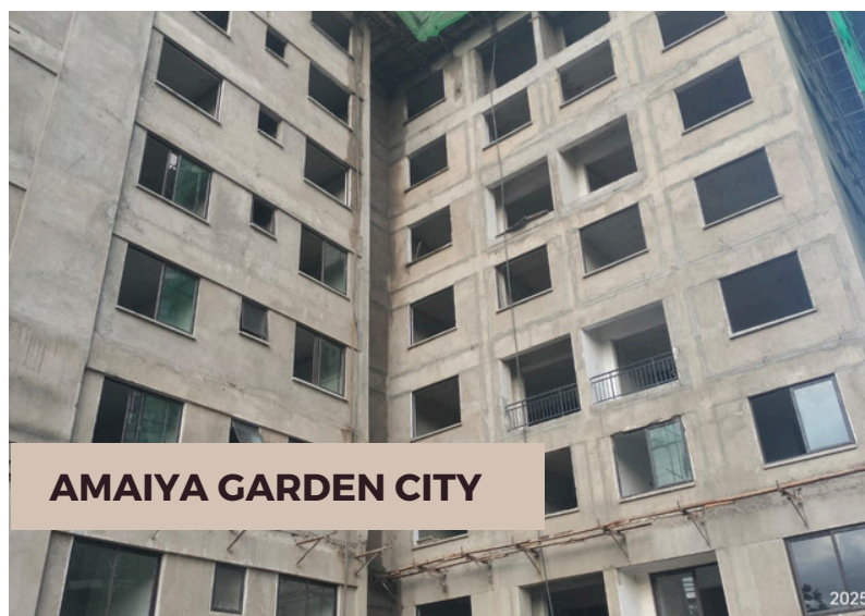
AMAIYA GARDEN CITY