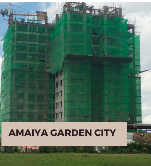
AMAIYA GARDEN CITY