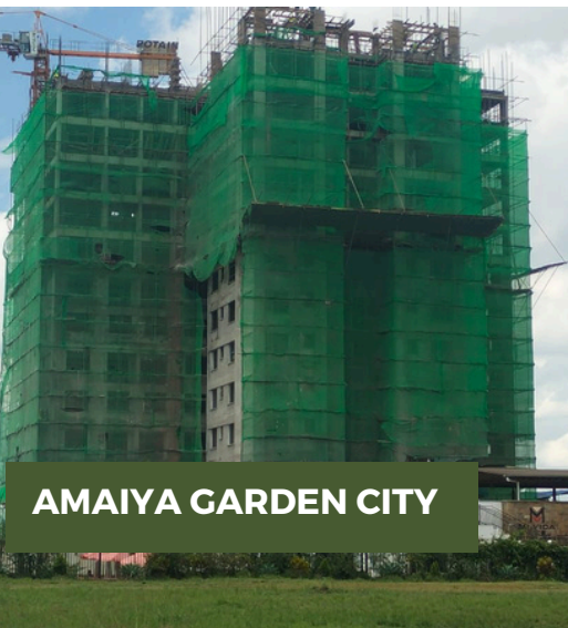
AMAIYA GARDEN CITY

Phase 1 works are now complete, with infrastructure—including roads and cabro paving—substantially done. Phase 2 continues on schedule. KEZA is gearing up to welcome its first residents, reinforcing confidence in the project's delivery and value.