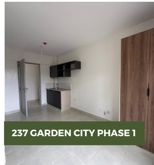
237 GARDEN CITY PHASE 1